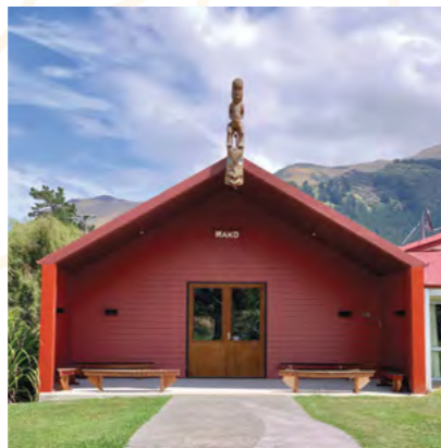
Wairewa Marae – Wairewa Rūnanga