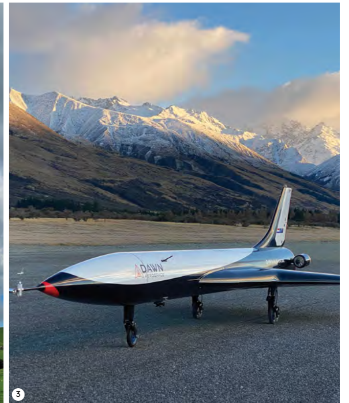
1 - Kea Aerospace 2 - Swoop Aero 3 - Dawn Aerospace