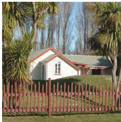
Te Pā o Moki – Te Taumutu Rūnanga

In this way, the dual kaupapa of Tāwhaki are connected and complimentary, and bring together mātauranga Māori and innovative technology to help understand our world and to navigate the future together.